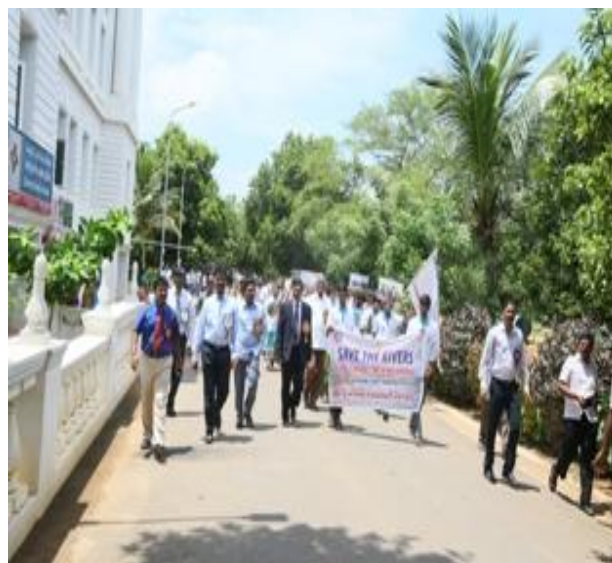
NSS Team in the Rally on Save the River and Go-Green with placards