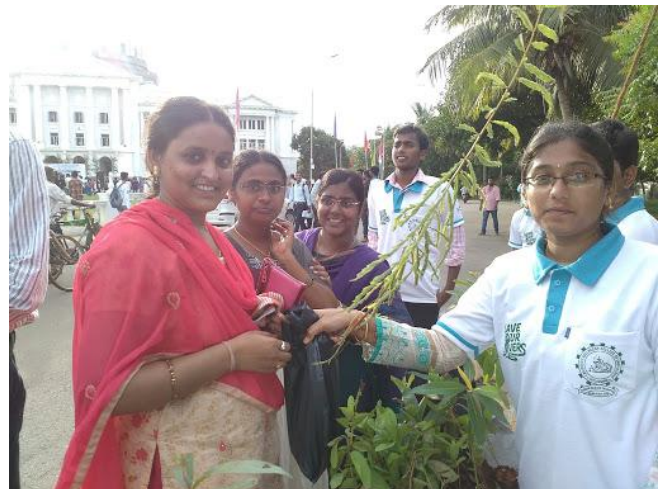
NSS Programme Officer distributing the Tree Saplings Go-Green Volunteers distributing Tree Saplings