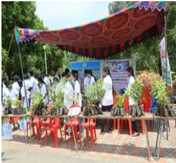
NSS Programme Officer with Go-Green Team