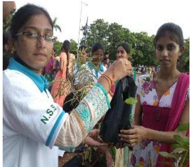
Go-Green Volunteers distributing Tree Saplings